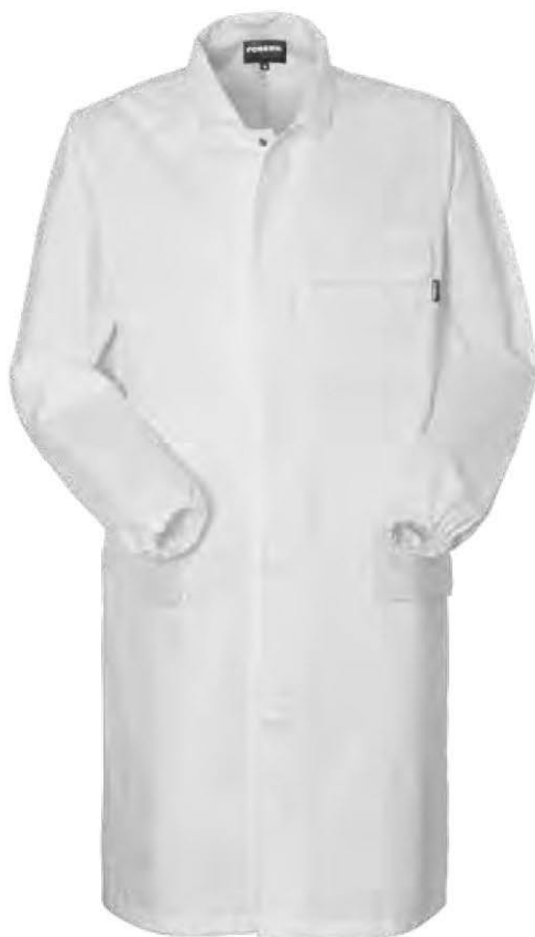
02 - BIANCO 02 - WHITE